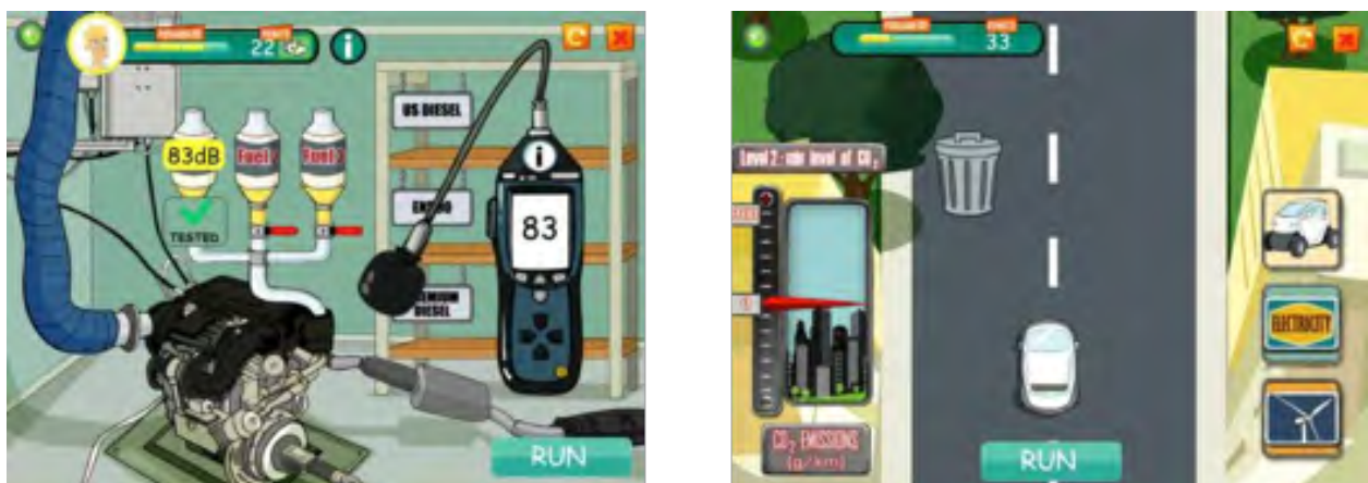
Figure 2. The Serious Game during third and fourth weeks of the MOOC .

The Serious Game was considered a positive asset of the MOOC by 96% of the students. Moreover, it was a good complementary tool for practical work in a massive learning structure.